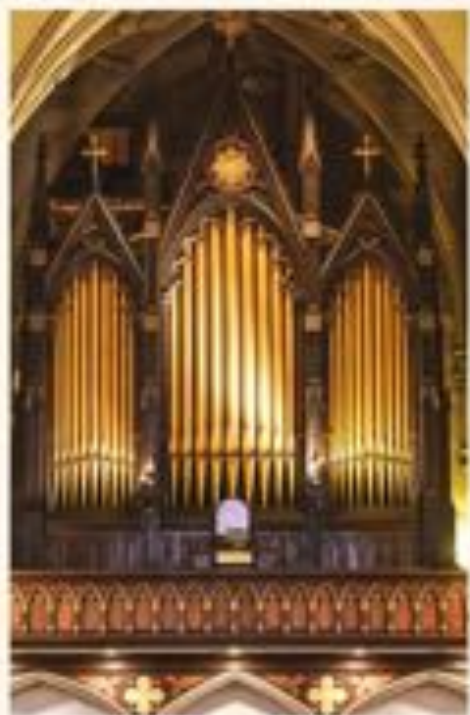
▲ St Patrick's historic Erben organ