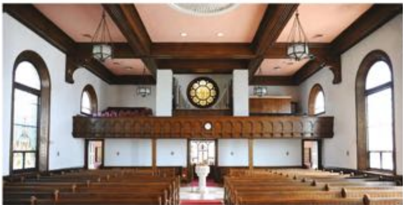
▲ (top) The tilting tubbers in side jamba recalls late Aeolian consoles from 1928-31, and permits a narrower shape; (above) the Amphoral